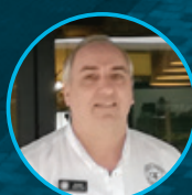
Russell Curwen Quick Crepes