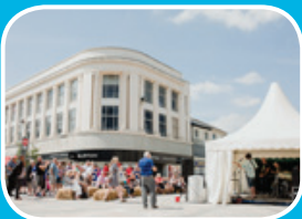
Frequently Asked Questions P21