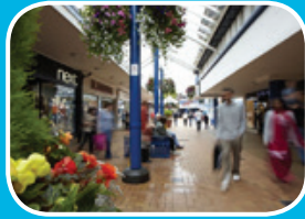
Why does Burnley Need a BID? P3