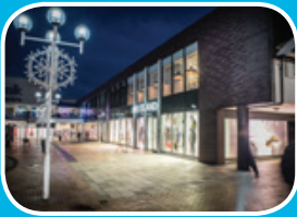
Guiding Principles for the BID P8