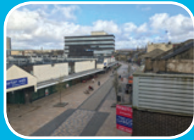
BID Benefits for your Business? P9