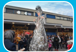
Theme Three P15