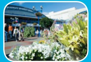
Further Key Information P20