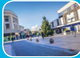
How much will it cost your business P6