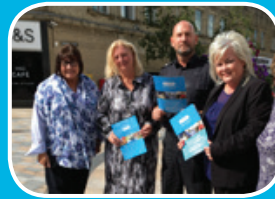
The Burnley BID Steering Group P10