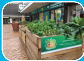
Theme One P12