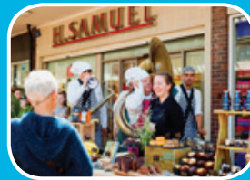
The Ballot P19