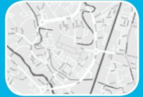
The BID Area P7