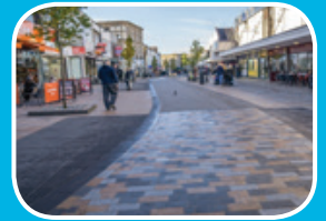
What will the BID Deliver? P11