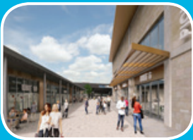
How the BID will Operate P16