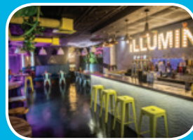
Theme Two P14